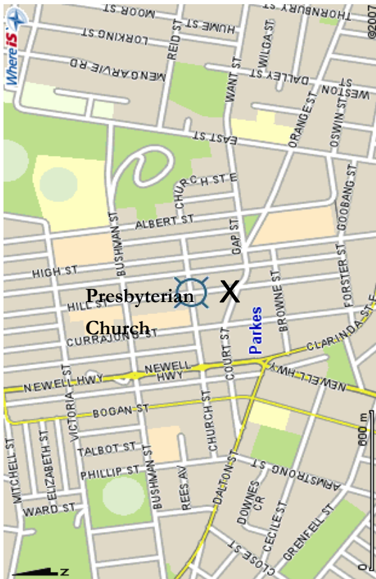
Parkes Presbyterian Church Crn Hill & Gap St

"Great opportunity to learn, meet others, increase understanding."